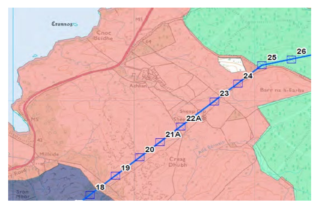
Plate 4.2: OHL T18 to T25