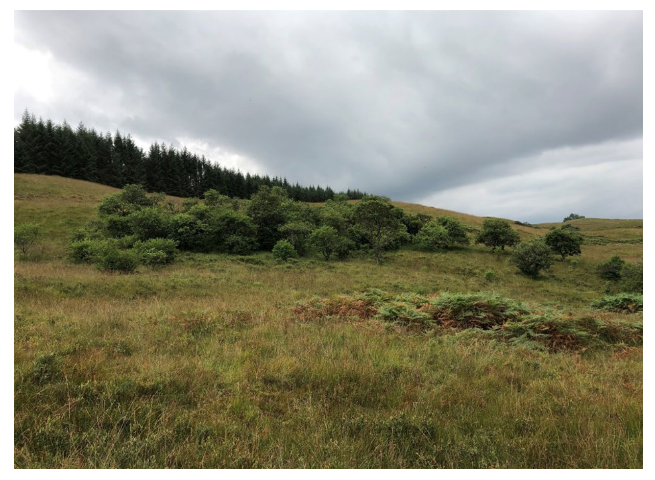
Plate 5.1: Looking west to tower location 18.