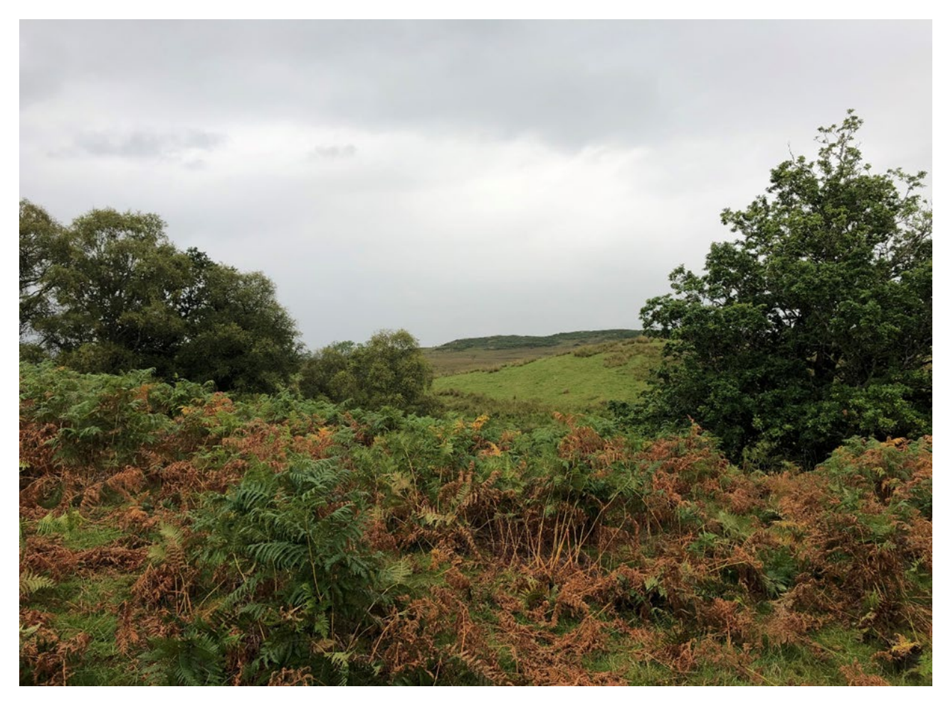
Plate 5.2: Looking east to tower location 22.